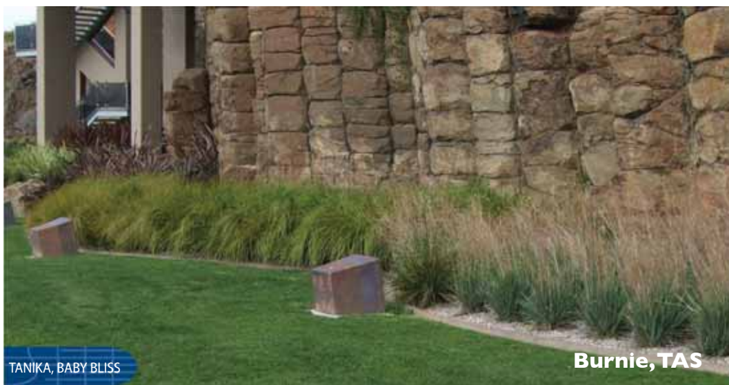
TANIKA, BABY BLISS