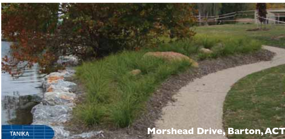
Morshead Drive, Barton, ACT

Dianella Little Rev is a very good performer in ACT that generally keeps very clean foliage. Pennisetums can be used successfully in ACT like Purple Lea above. As with all native grasses they will brown off in winter and do benefit from being cut back annually in late August to early September and then let it reshoot.