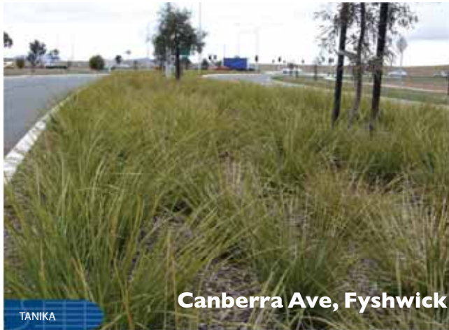
Canberra Ave, Fyshwick