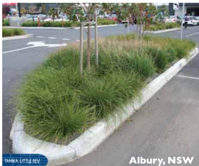
TANIKA, LITTLE REV

Peards Nursery in Albury is continuing to promote the drought tolerance of Ozbreed strappy leaf plants.