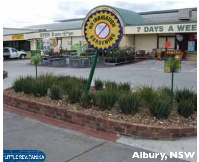
LITTLE REV, TANIKA

After 3 years these Tasred and Little Rev have created a feature landscape. The plants are performing very well in this roadside environment. Little Rev has remained maintenance free so far. Tasred may need older leaves trimmed infrequently if required.