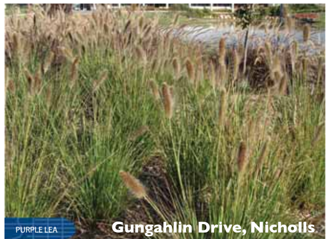
Gungahlin Drive, Nicholls