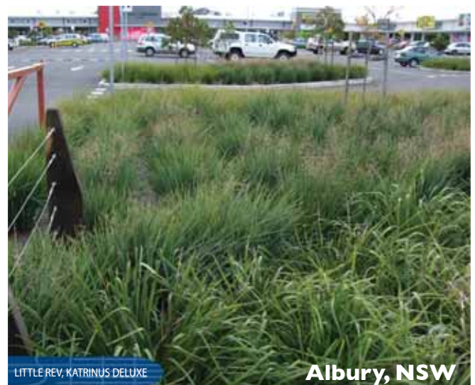
LITTLE REV, KATRINUS DELUXE

The carpark plantings in Albury are showing that Tanika, Little Rev and Katrinus Deluxe have the ability to cope with no irrigation once they are established.