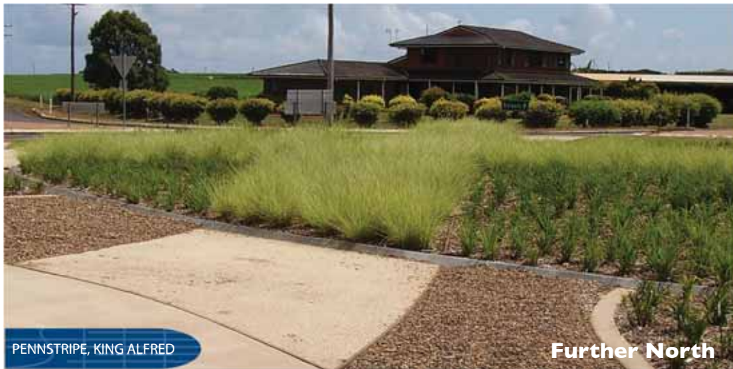
PENNSTRIPE, KING ALFRED