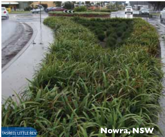
TASRED, LITTLE REV

Pennstripe gives the best contrast and is a very tough plant. It works well all over Australia.