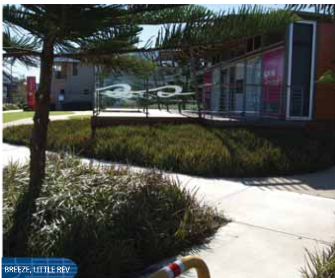
BREEZE, LITTLE REV

Little Rev is one of the most popular landscape plants in WA.